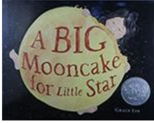
A Big Mooncake for Little Star , illustrated and written by Grace Lin

Lin's detailed compositions and palette create a wholly original fable imbued with traits of the Chinese Moon Festival. A mischievous child and her mother bake a mooncake and the temptation of sweet treats unfolds nightly against an inky black sky. The phases of the moon have never been so tasty!