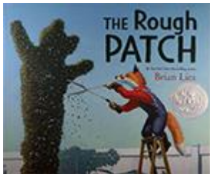
The Rough Patch , illustrated and written by Brian Lies

Lin's detailed compositions and palette create a wholly original fable imbued with traits of the Chinese Moon Festival. A mischievous child and her mother bake a mooncake and the temptation of sweet treats unfolds nightly against an inky black sky. The phases of the moon have never been so tasty!